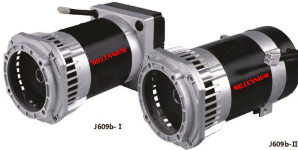
J609b - I